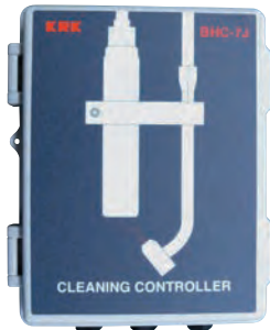
Control unit BHC-7J