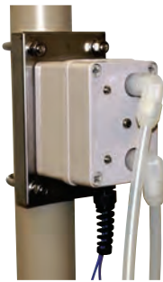
Electro-magnetic valve unit SVU-1B