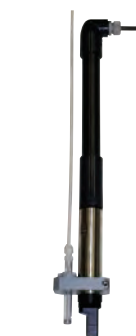
for Turbidity Detector