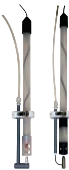
for pH Detector