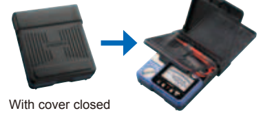
With cover closed