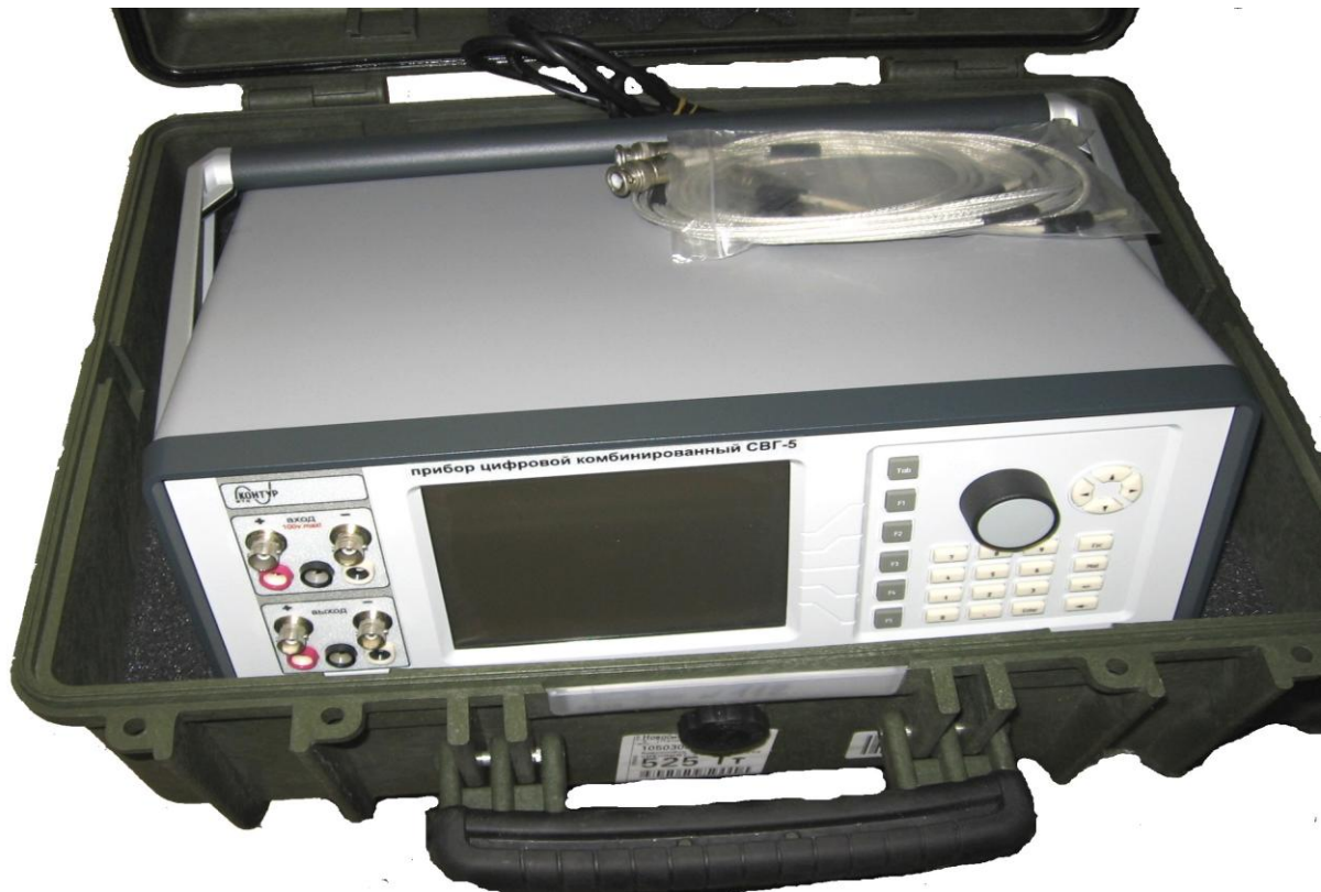
Fig.4 Transporting case for SVG-5 device.

5.3. SVG-5 device together with technical documentation and connecting cables is packing into the especial transporting case, which provides a storage and transportation of a device (Fig.4).