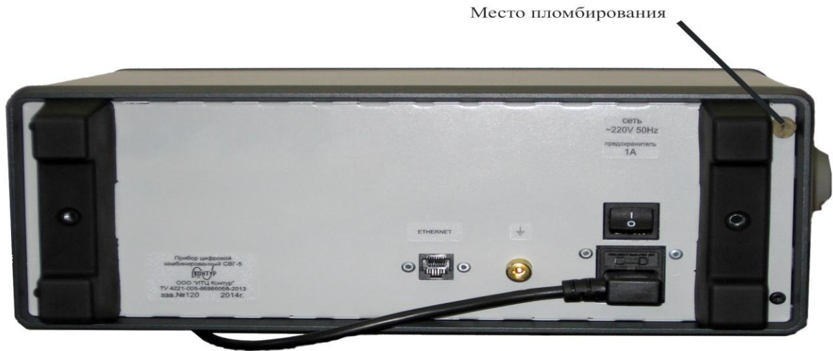
Fig.2 Rear panel of a device.