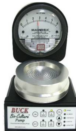
Calibration Head Attached to Pump