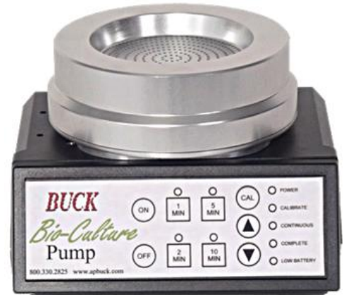
Model B30120 30-120 LPM Programmed Sampling for Bio-contaminants Sampling

The front key pad is organized into three functional key groups: Power (ON-OFF), Timing (1, 2, 5, 10 minute samples), and Calibration (Cal mode, Increase flow, Decrease flow). Positive tactile feedback is provided by the keys. The BUCK Bio-Culture™ Pump has internal NiCad batteries to provide a full six hours continuous run time at 100LPM. The standard charger provides a battery recharge in 12-16 hours and allows the unit to operate on AC power; the optional FastOne™ Charger provides a battery recharge in one hour. End of sample notice is provided by the lit LED “Complete” and three short beeps.