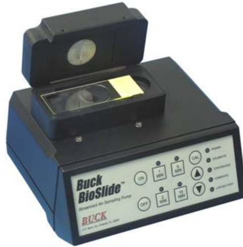
Controlled Flow Sampling Pump for Gel-Impaction Slides

*Depends on battery maintenance, backpressure, etc.