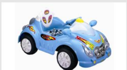
All Kinds Of Electric Ride-On Toys